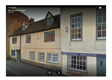
15 High Street, West Wycombe where Constance died